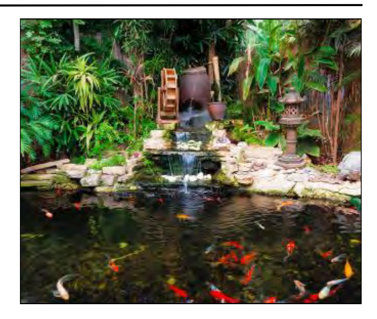
Adding Hydra Enhance directly to the koi food/fish food: